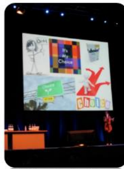
IATEFL Glasgow 2012 Pecha Kucha event