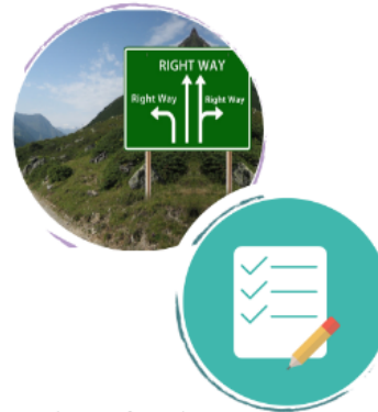
Image by Pettycon from Pixabay https://pixabay.com/illustrations/list-icon-symbol-paper-sign-flat-2389219/

Image by Card Almann from Pixabay https://pixabay.com/illustrations/meadow-away-panorama-830607/