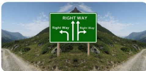
Image by Gerd Altmann from Pixabay https://pixabay.com/illustrations/meadow-sunny-panorama-680607/