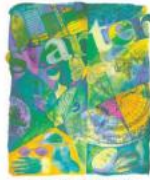
Starter Student's Book