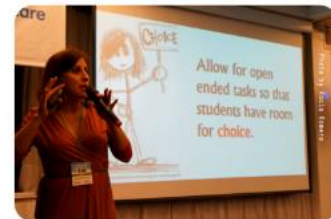
Share Convention 2015

f /saumellsimonetti t @saumellsimonetti i saumellsimonetti